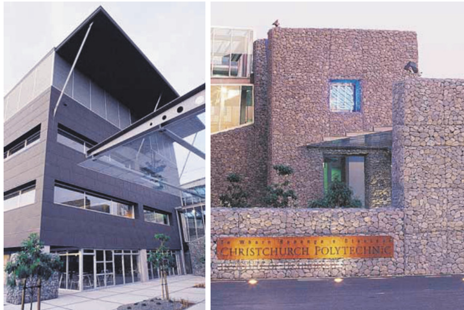
Christchurch Polytechnic Institute of Technology campus, Christchurch, New Zealand.